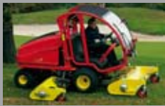
TURBO 5-6-6 FLAIL 50-60 HP