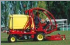
TURBO 1-1W-2-4 28-44 HP