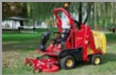
GT 23-30 HP