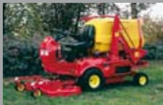
PG 23-30 HP