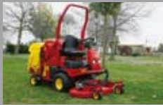
GTS 16-22 HP