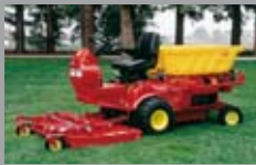
SR 23-30 HP