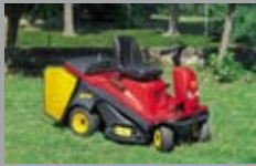
GTM 15,5-16 HP