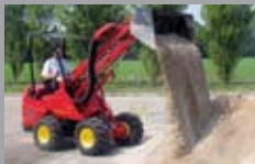
TURBOLOADER 22-36 HP