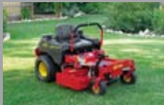
SRZ 15-27 HP